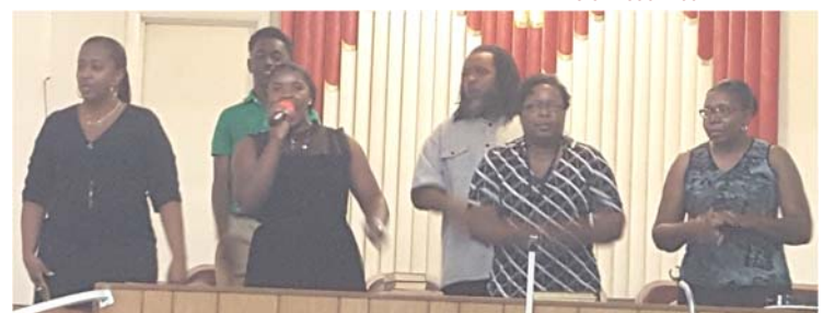
Siloam Baptist Church Choir