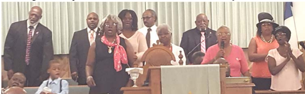
Canaan Missionary Baptist Church Choir

It is better than anything. It is better than the first Adam. You've got to hold on to the hope of Jesus Christ. This is a concrete hope. It's a lively hope. In other words, Jesus is alive and well and He's got all power in his hands. It is a hope of expectation. We are expecting something out of Jesus. It is a desired hope. My hope is in Jesus. My hope is built on nothing less than Jesus Christ and His righteousness. I dare not trust the sweetest frame, but wholly lean on Jesus' name. On Christ, the solid Rock, I stand. All other ground is sinking sand. Jesus took trouble straight on. They met him in the Garden of Gethsemane. Jesus had his anchor in the Hope. They took Jesus to Ananias and Caiaphas. They sent Jesus to Herod. They hung him high and stretched him wide. Hope stayed on the cross from the 6th till the 9th hour. They pierced Hope in the side. They said Hope died. While they were partying, Hope went down into the grave. They thought Hope was dead. The grave said we've got Hope . Don't worry about putting any handcuffs on Hope -- nobody gets out of here. I've got Abraham, Isaac, and all of them down here. The first night, the grave said, we have Hope . The second night, the grave said we still have Hope . After the third night, the grave said, I don't know where Hope is, but I know what time Hope left. Hope left early Sunday morning with all power in his hand. "That's A Better Hope."